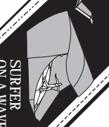
SURFER ON A WAVE